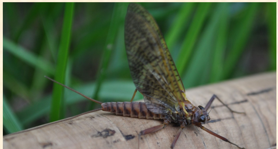
The iconic March Brown, this insect is important to anglers but is increasingly rare in the UK, information about sightings of this animal will be useful as the Annan is one of the few remaining strongholds.