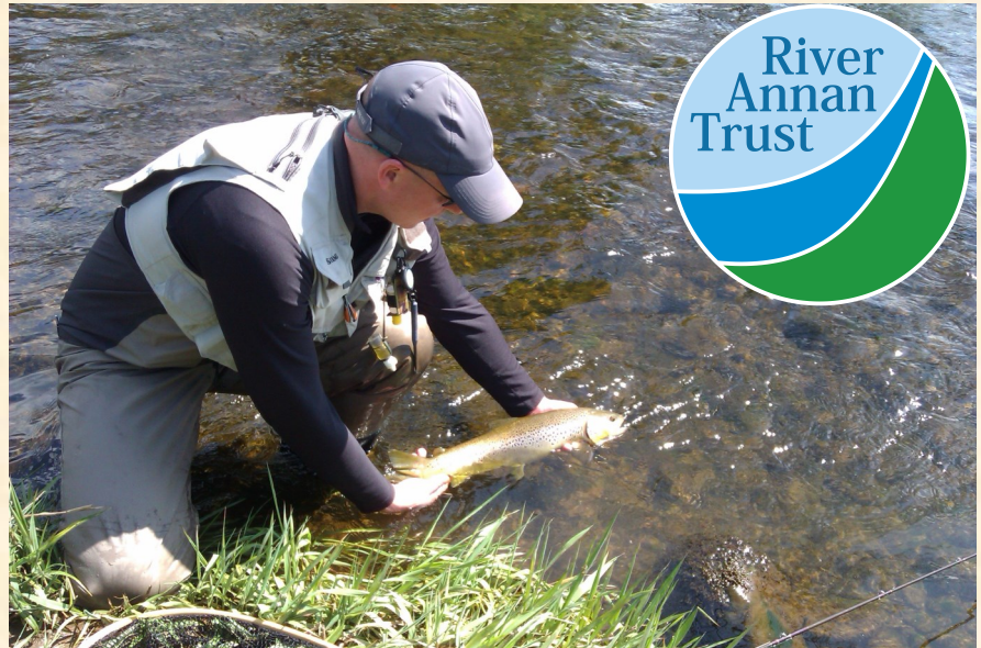
A 5lb summer brownie being returned in 2012